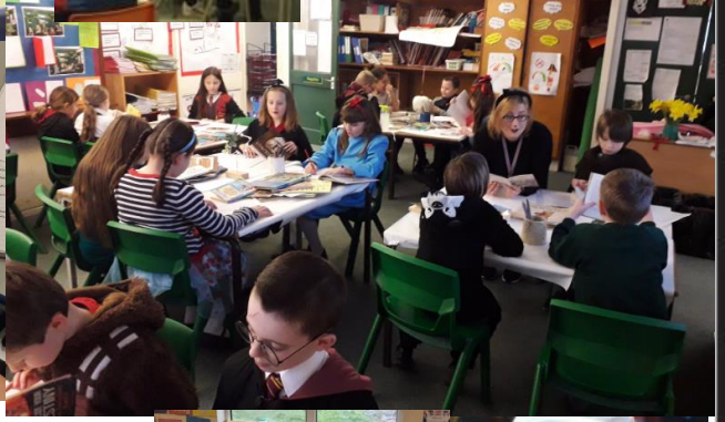
Some of this week's highlights