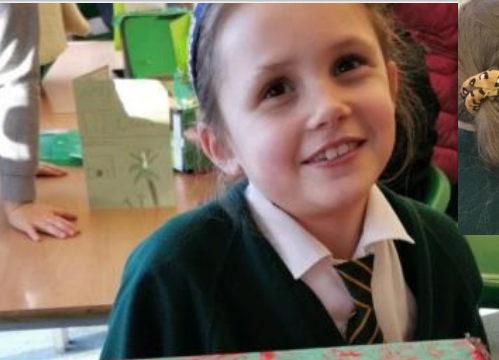
Some of this week's highlights