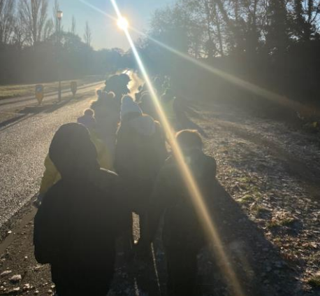
Chains of Hope